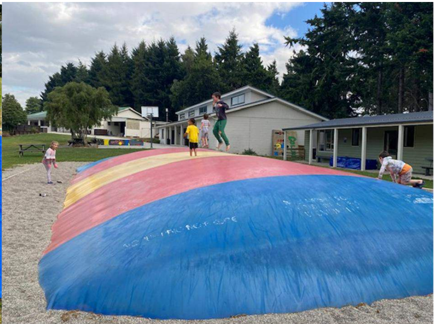
We had so much fun...and we will be back next year!