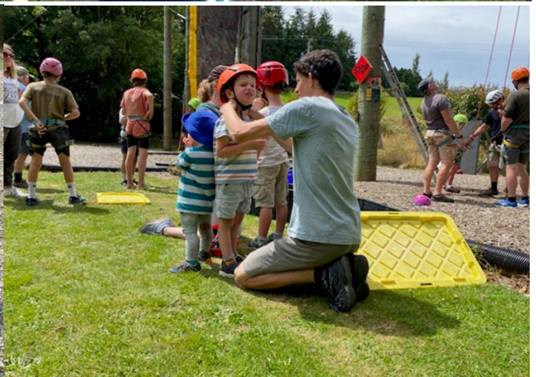
We challenged ourselves and learned new skills