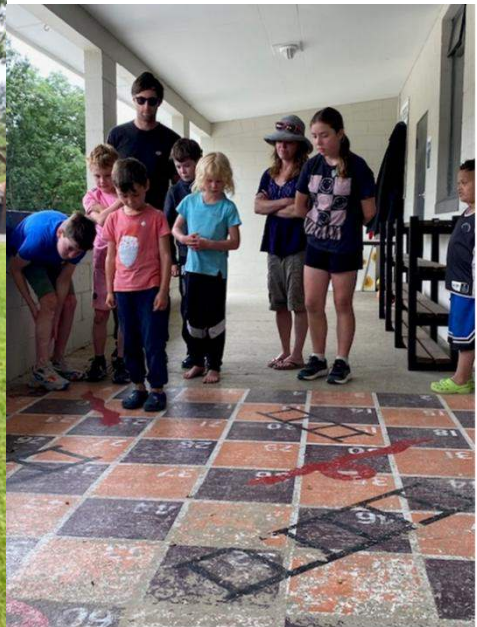
We learned to work together as a team