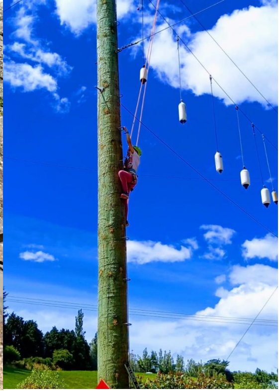
We showed courage and climbed really high...!