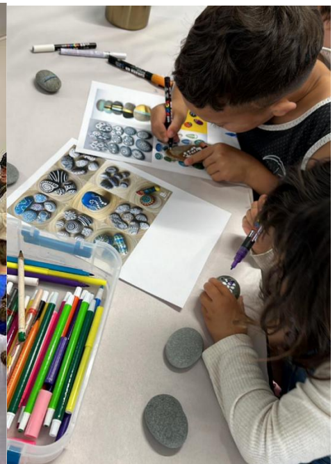
We worshipped God together and learned more about following Jesus