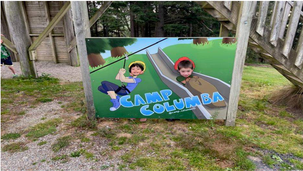
St John's Arrowtown & Flagstaff Summer Camp @ Camp Columba