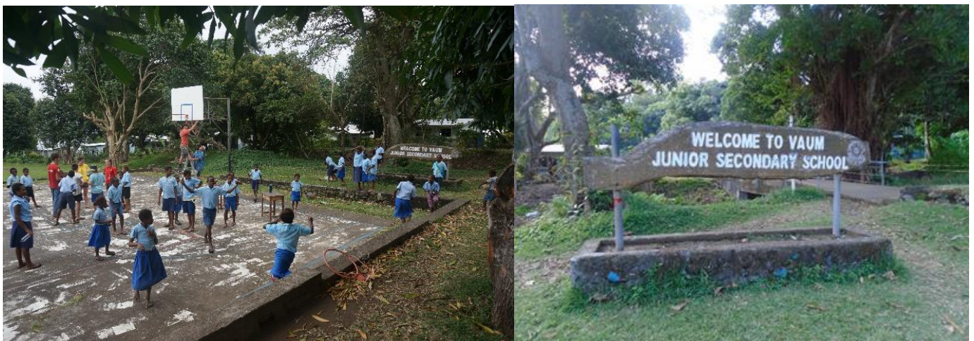
Vaum Junior Secondary School. Liro, Paama, Vanuatu - Boys' Auxiliary Dormitory Maintenance

The same team as last year is returning with the task of repairing the shutters of the boys' auxiliary dormitory and the door of the main dormitory. To date $1500-00 has been raised or donated. This has covered the purchase of wood and paint. Prayer for funds to cover the transport of the materials, screws and other items would be appreciated.