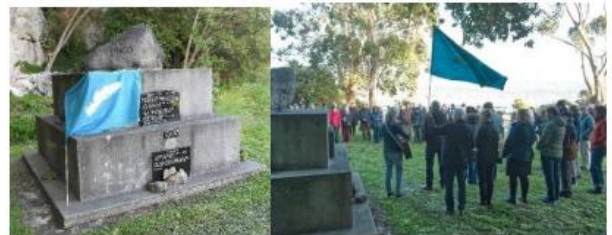
Following the dawn service, we shared a warm breakfast hosted by Araiteuru Marae