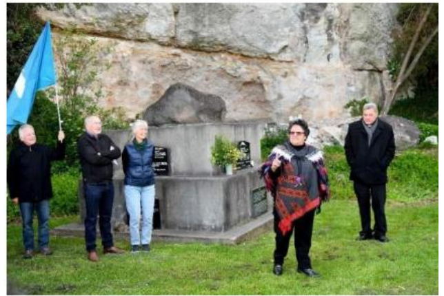
Dawn Service 7 am, November 5th at the Rongo Stone. Close to 100 people attended.

Planting and upkeep continue at the Parihaka Memorial by members of the Flagstaff Community Church and Community Choir and it looks well-loved! The Dunedin City Council, on request, gave the area surrounding the Rongo Stone a spruce up also.